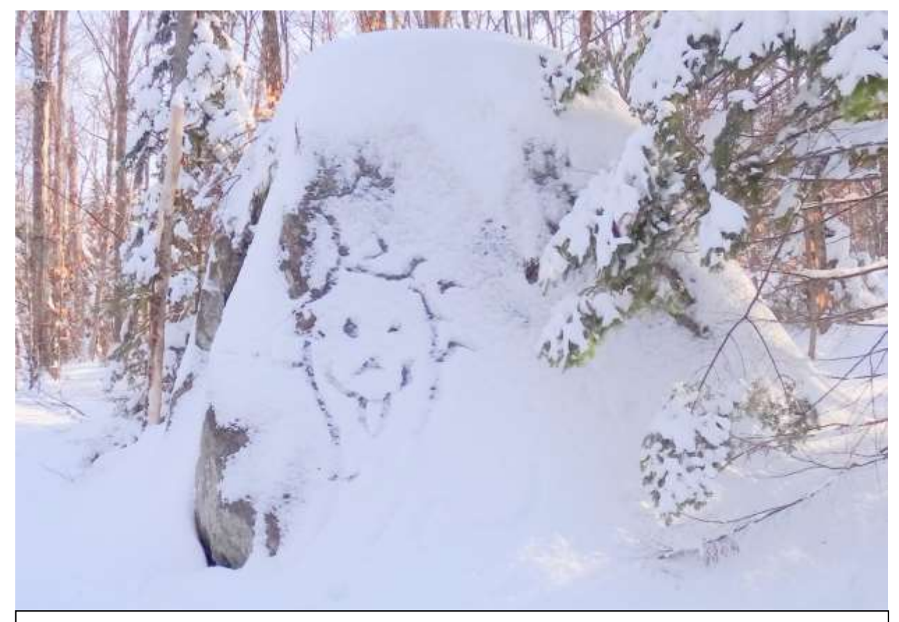
Evidence of a "snow artist" at work here!