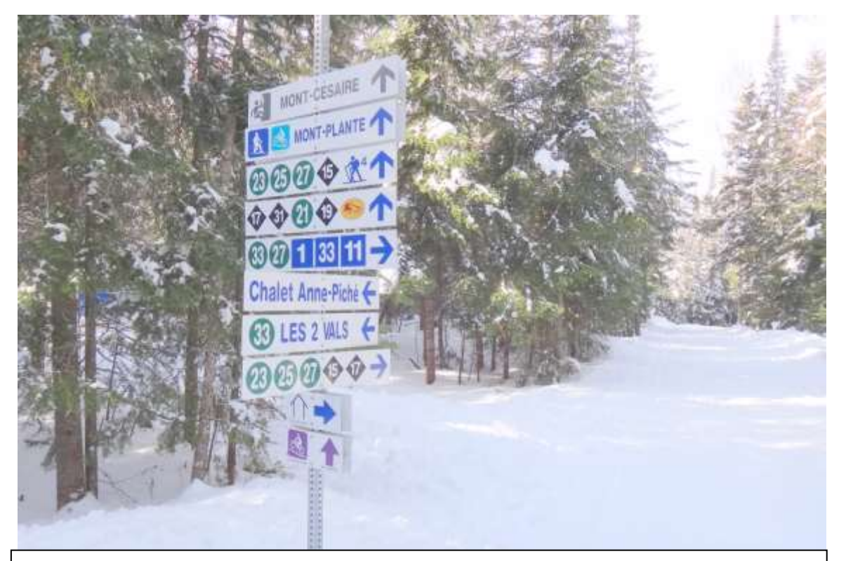
So.....which way now....Tour Leader?