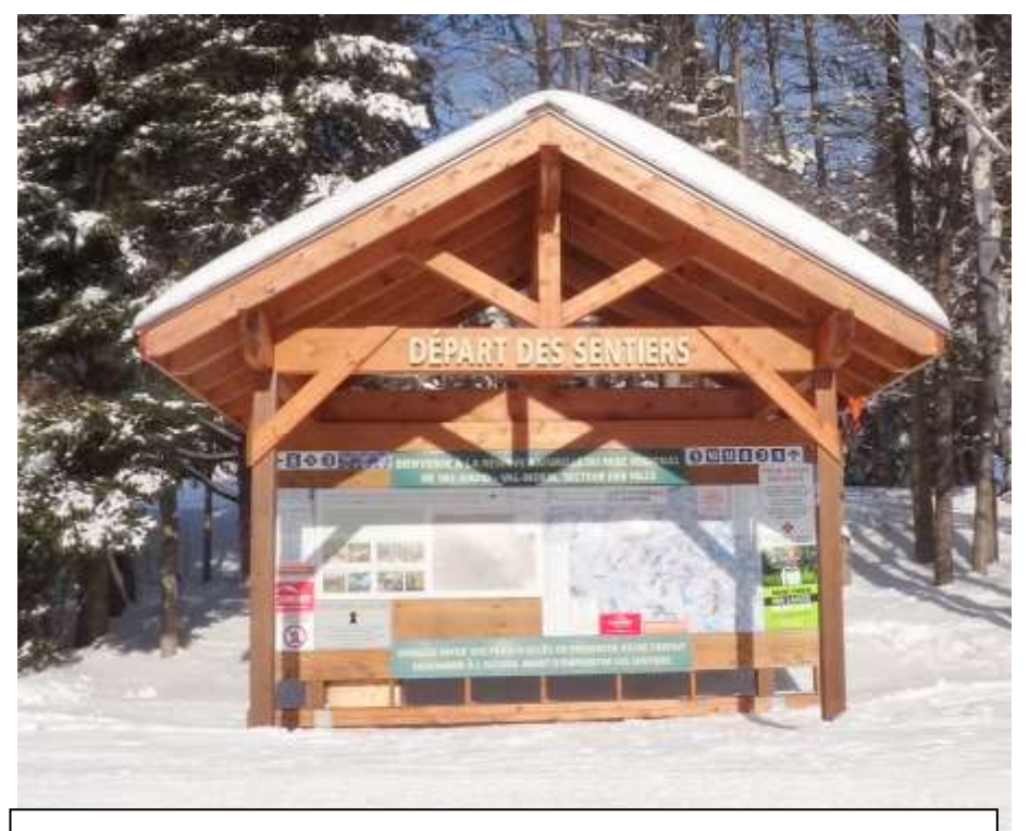
Outdoor information website!