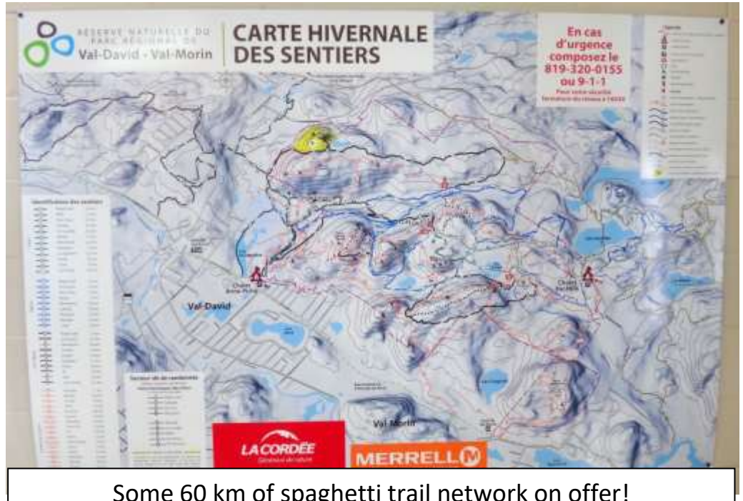
Some 60 km of spaghetti trail network on offer!