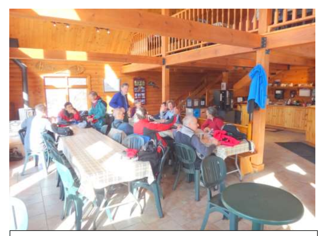
Viking lunch invasion at Chalet Anne-Piché