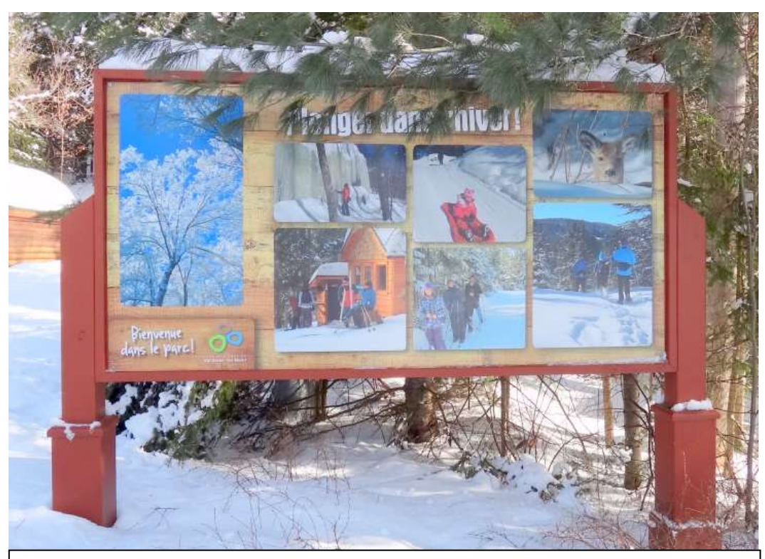
Some "Joys of Winter Life" propaganda!