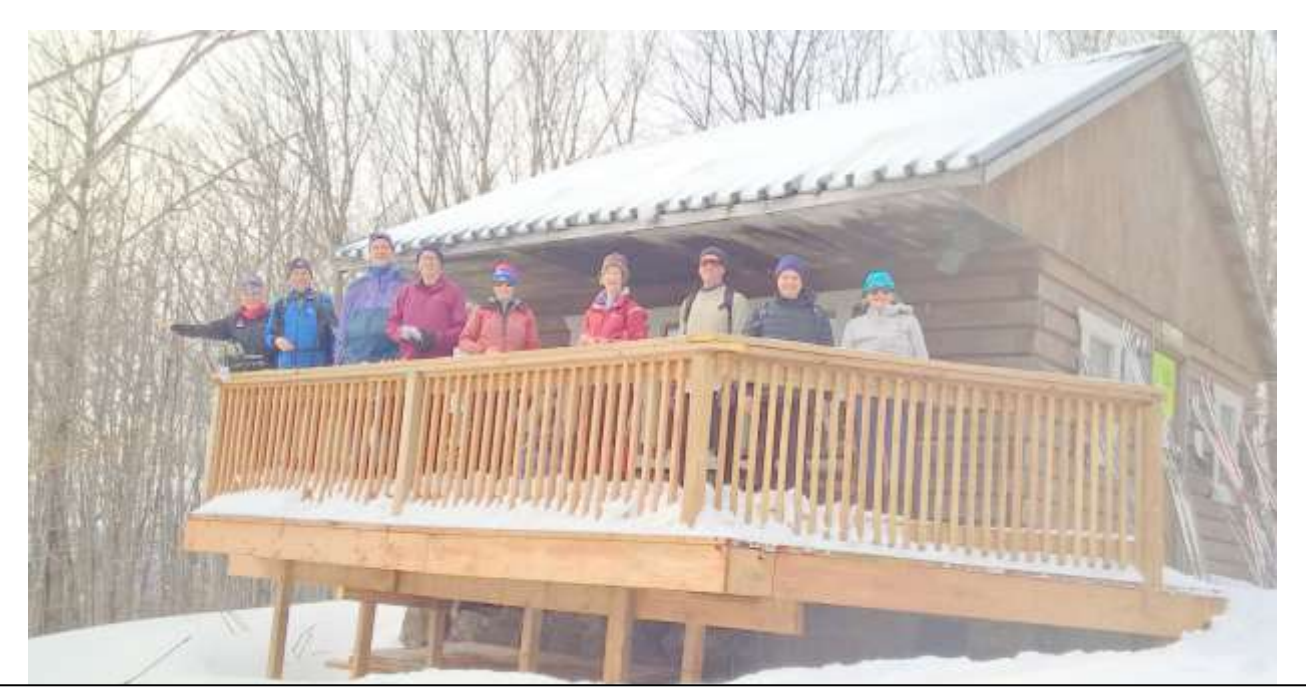
The 2/3 rds of the group that finally made it up to the 500m high Loup-Garou summit!