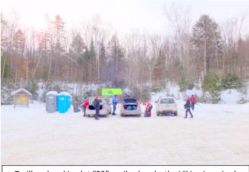
Trailhead parking lot "P3" easily absorbs the Viking invasion!