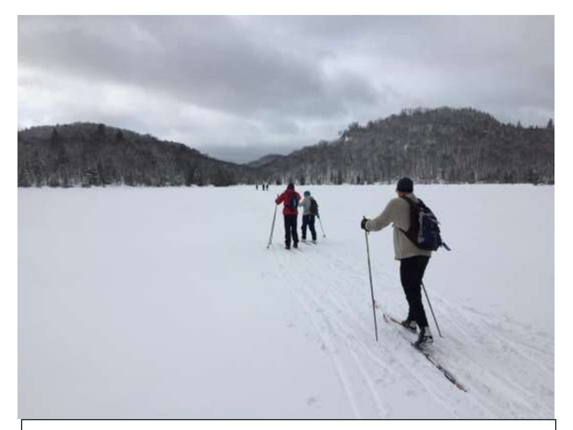
A windy start to traversing Lac du Corbeau!