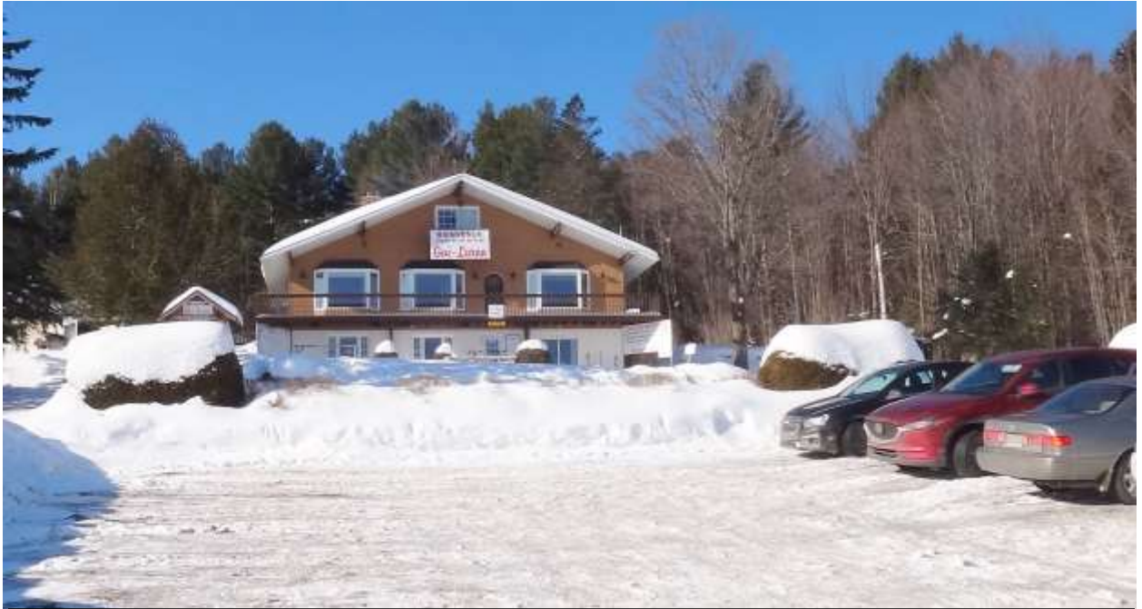
The Gai-Luron x-c ski centre, created back in 1971