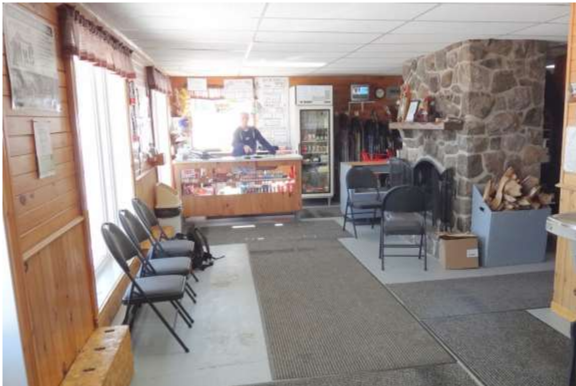
A warm welcome.....“Bon Jour.....can I help you?”