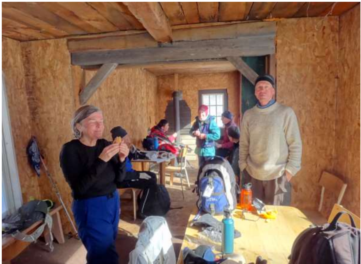
Making ourselves at home in the trail-side relais!