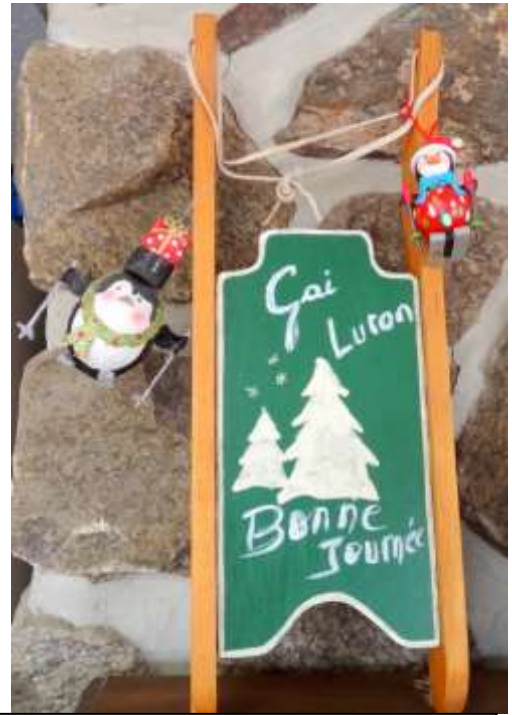
Some comic Gai-Luron reception area characters.