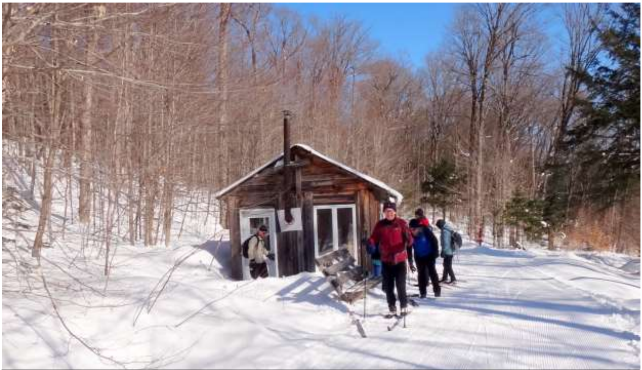
We stop off at a relais to warm up..... and gas up!