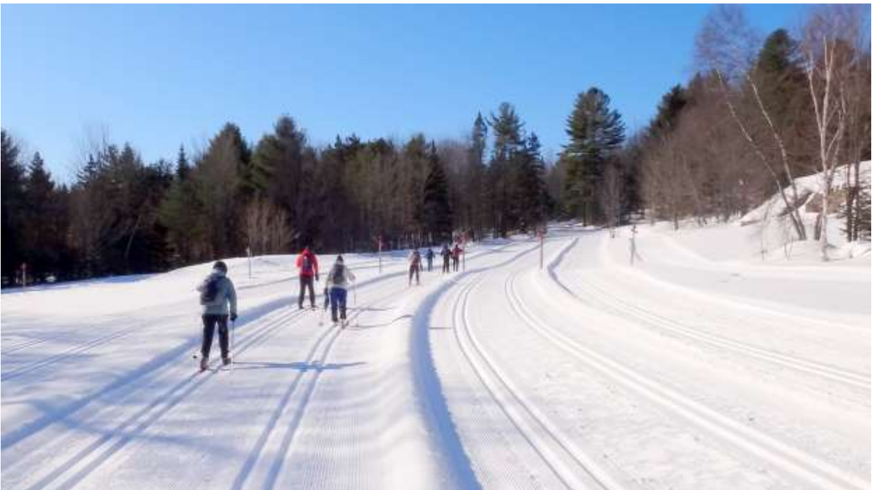
We set off on seemingly Olympic standard ski trail tracks!