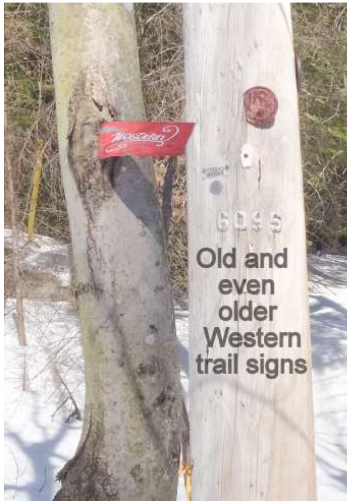
Old and even older Western trail signs