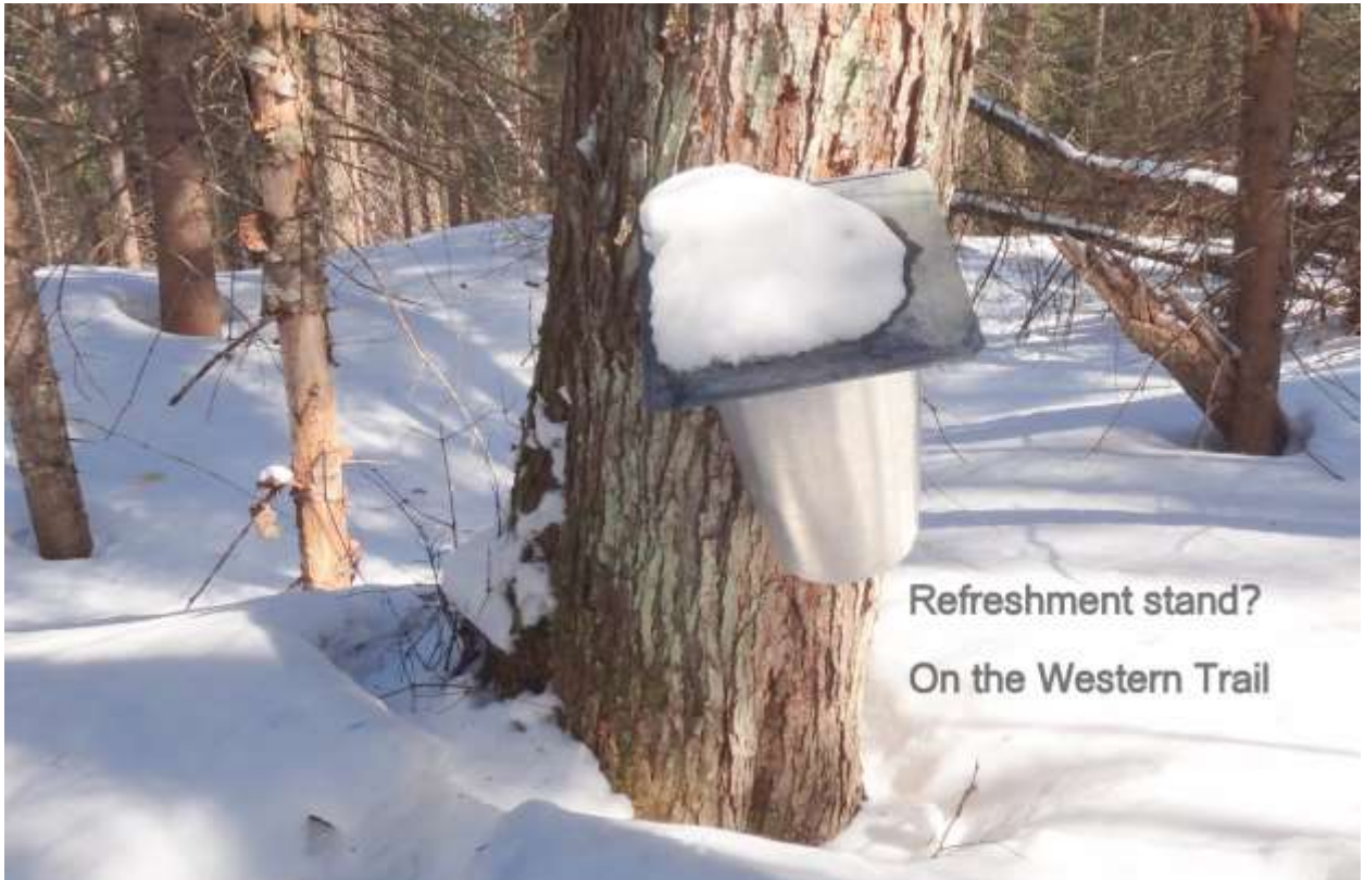
Refreshment stand? On the Western Trail