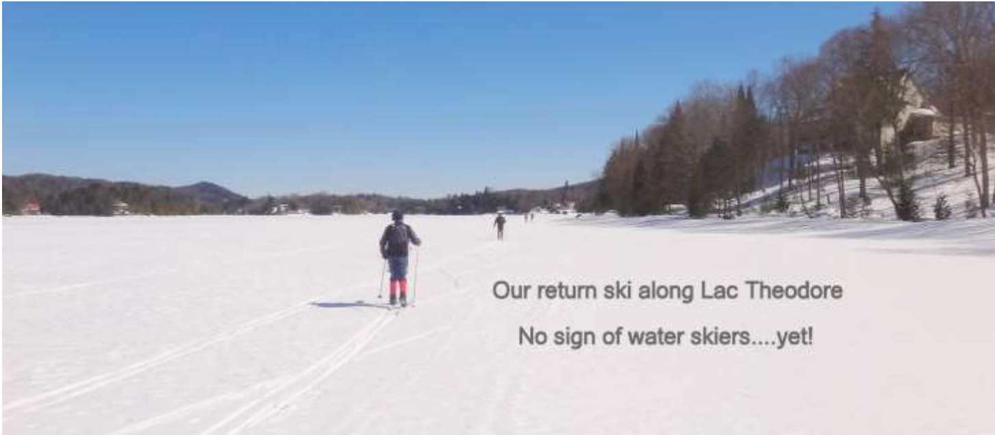
Our return ski along Lac Theodore No sign of water skiers....yet!