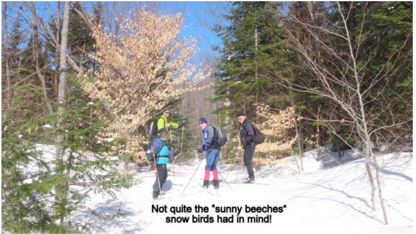
Not quite the "sunny beeches" snow birds had in mind!