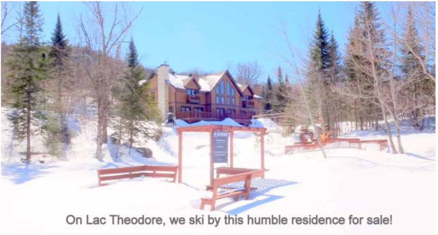
On Lac Theodore, we ski by this humble residence for sale!