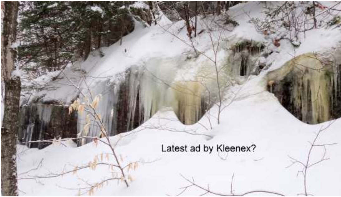
Latest ad by Kleenex?