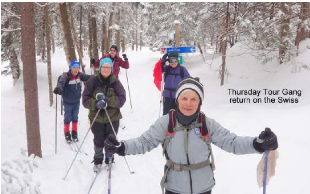
Thursday Tour Gang return on the Swiss