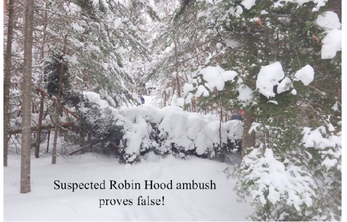
Suspected Robin Hood ambush proves false!