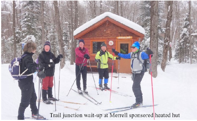
Trail junction wait-up at Merrell sponsored heated hut