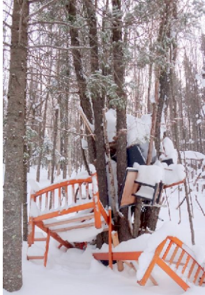
Cheap storage company?