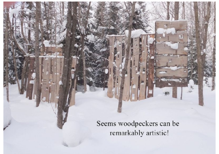
Seems woodpeckers can be remarkably artistic!