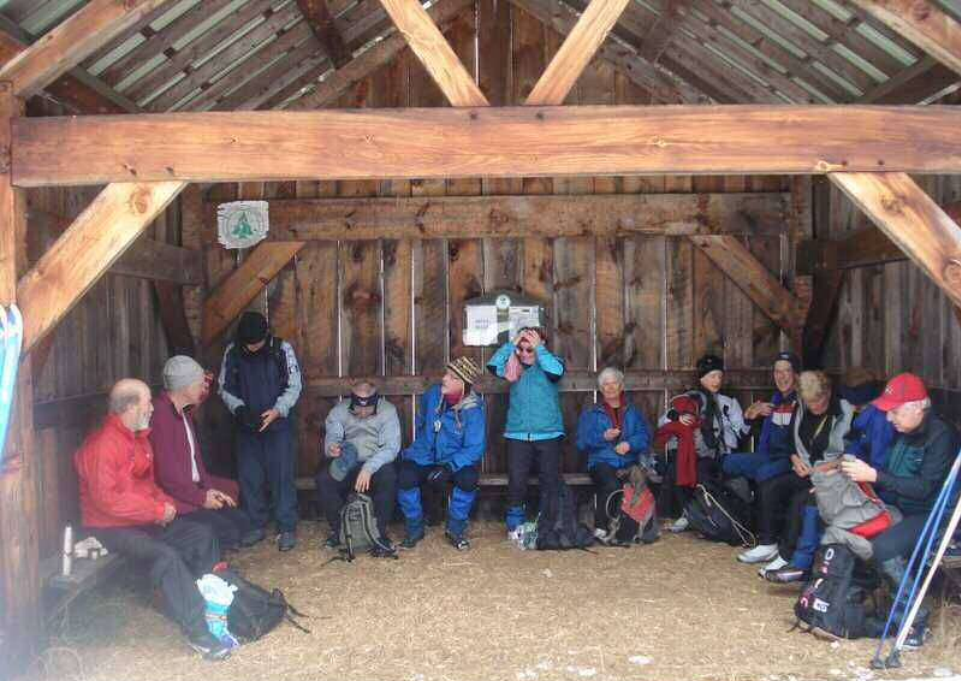
For some, the return dessert was the Triangle trail, for others, the Bellevue