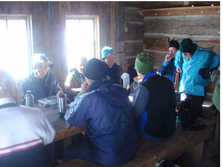
Vikings make themselves at home for lunch in this odd little Hansel & Gretel cabin. Strangely, this establishment - Refuge de L'Alpage - is not listed in the Michelin Guide!