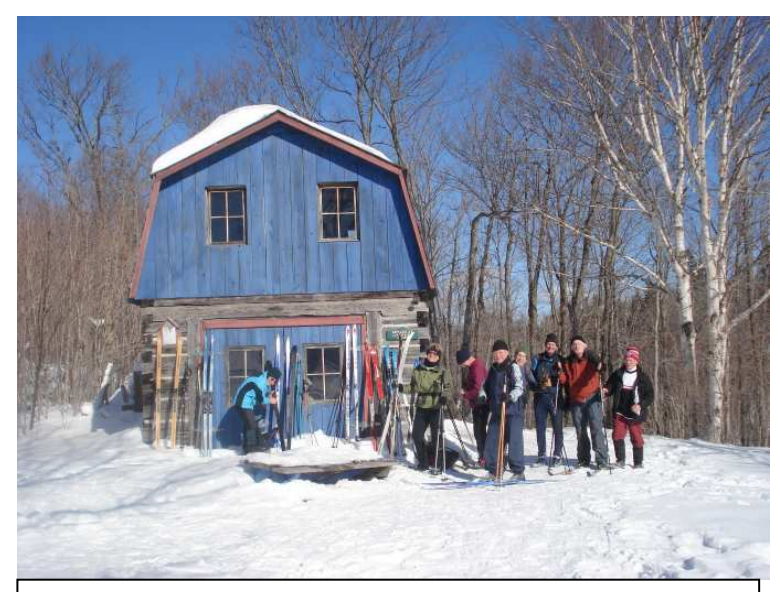
We sneak around the steep section of the Gillespie trail on the Catherine trail where, appropriately at lunch time, we arrive at the backwoods sleepover log cabin.