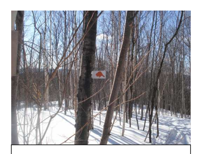
The return on this roller-coaster Castor trail produced more tumbling "Damns!" than beavers!

Fortunately, Gordon 911 Red Duct Tape Inc. was on hand to salvage the situation and managed to fashion a "replacement" serviceable pole out of a sapling...one advantage of skiing through wooded areas!