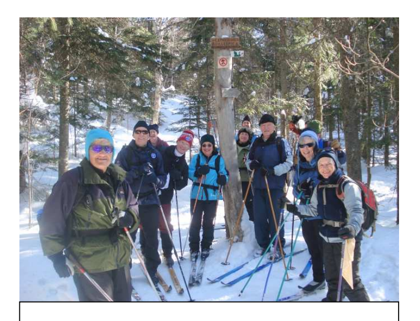
The Catherine trail leads us to the intersection with the famously historic Gillespie trail.