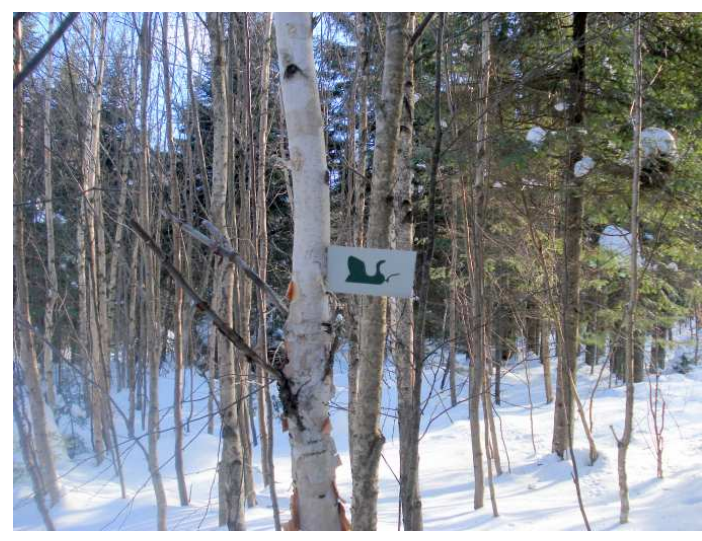
Setting off from the car park on the Catherine trail, designated by elegant swan signage.