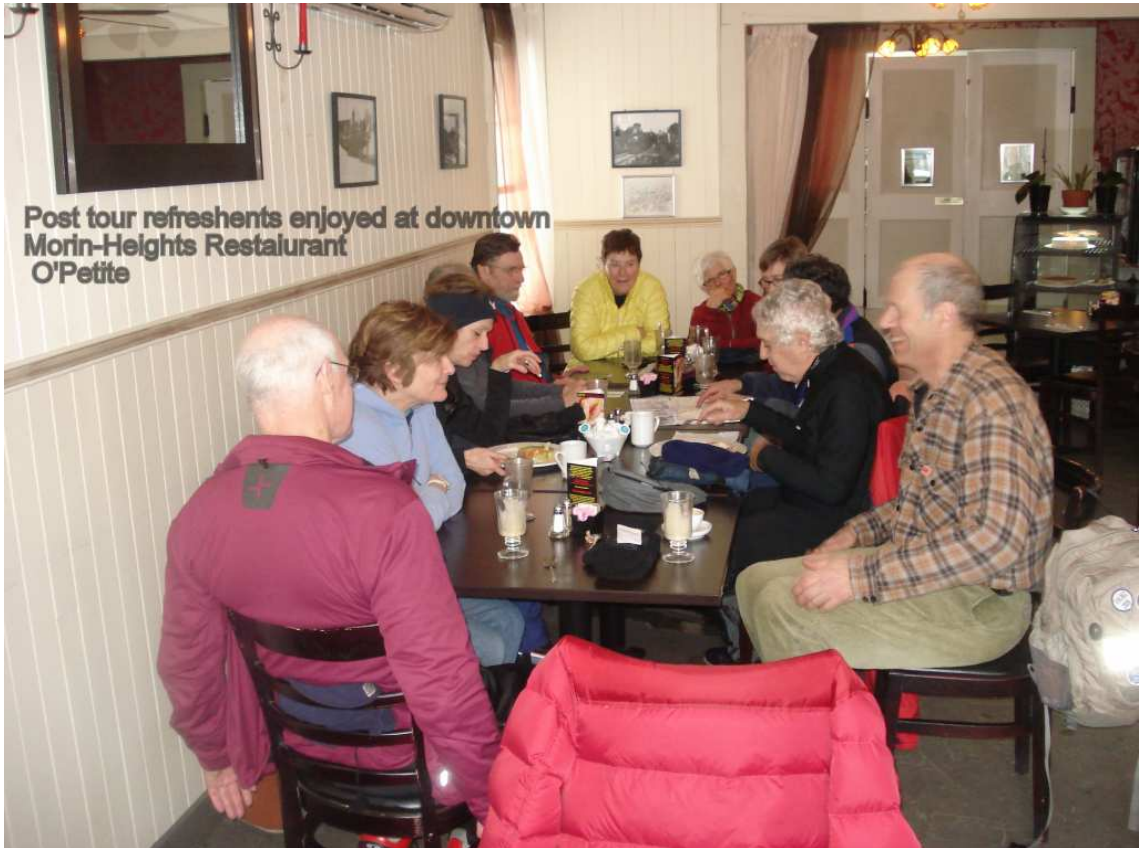
Post tour refreshments enjoyed at downtown Morin-Heights Restalurant O'Petite