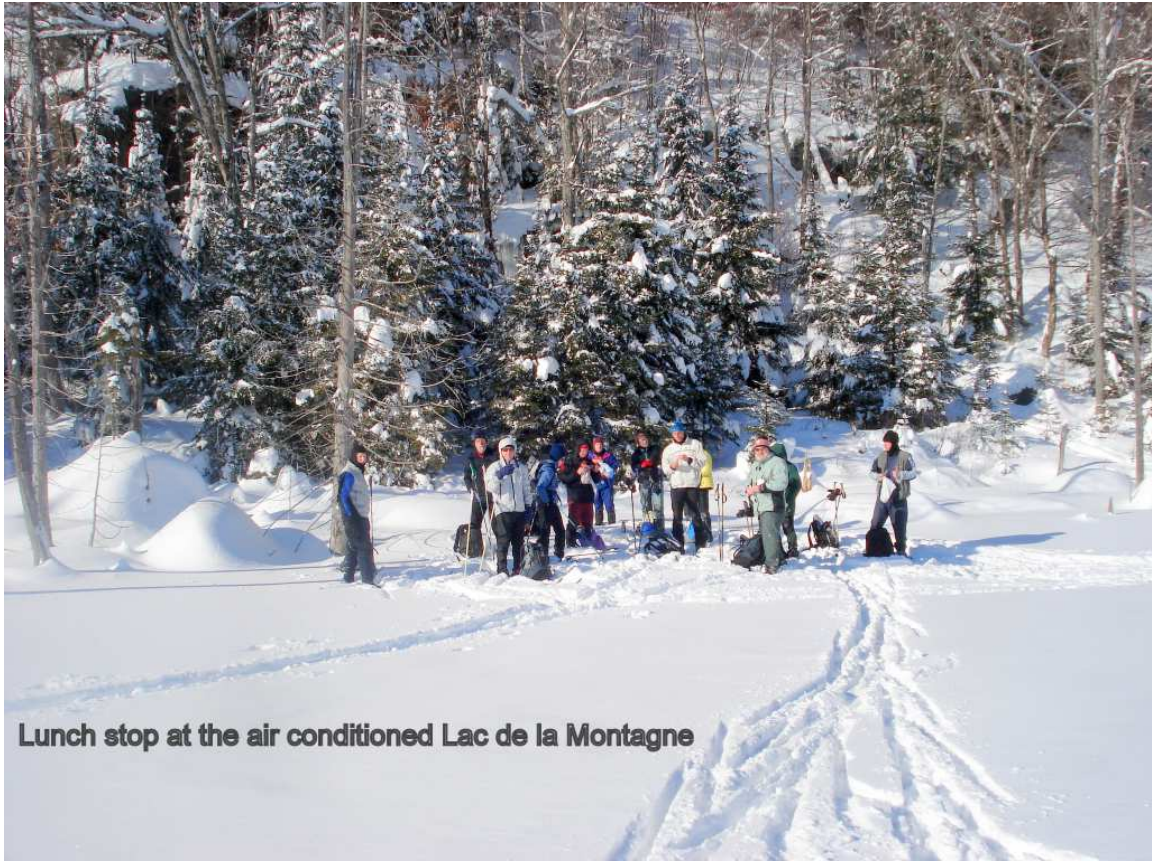
Lunch stop at the air conditioned Lac de la Montagne