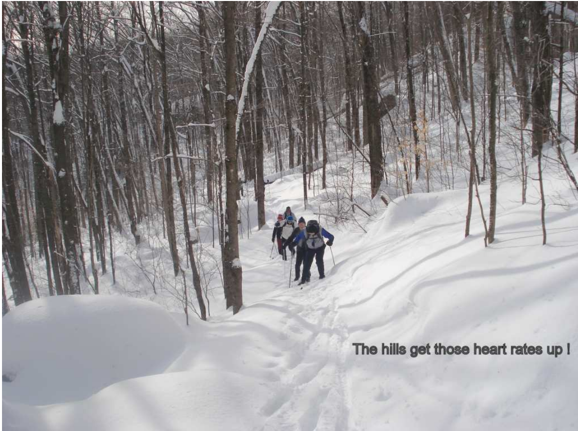
The hills get those heart rates up !