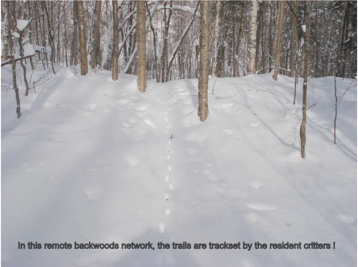
In this remote backwoods network, the trails are trackset by the resident critters !