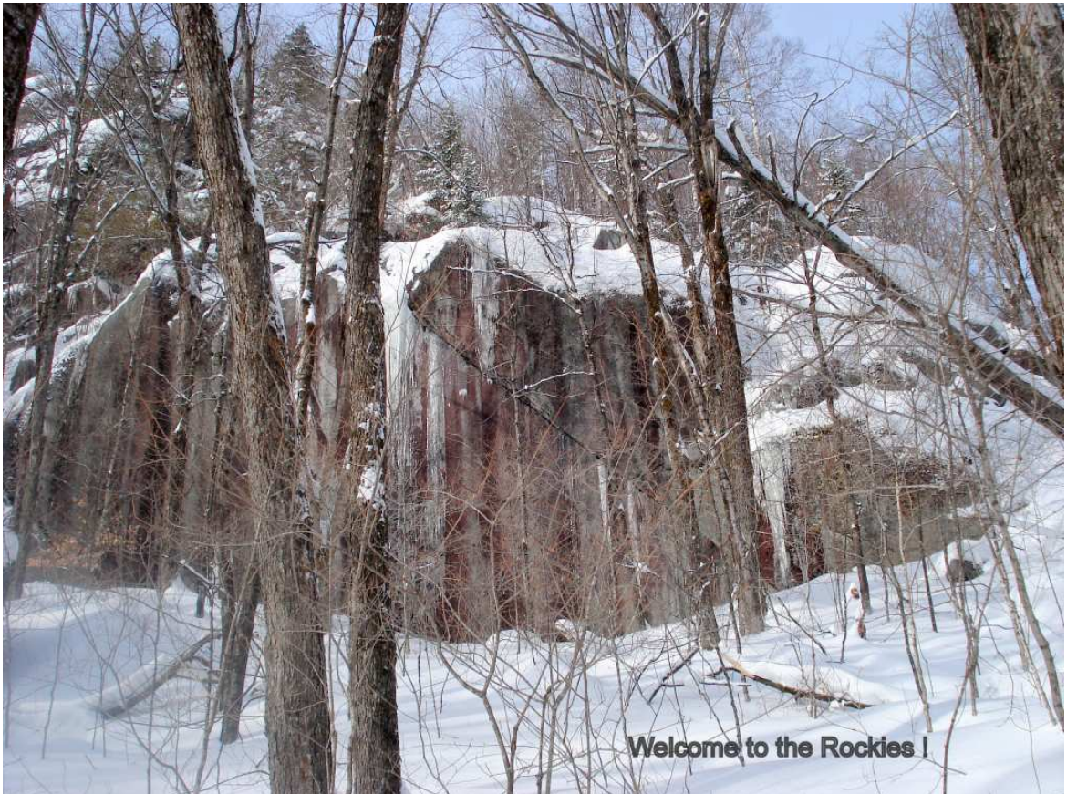
Welcome to the Rockies !