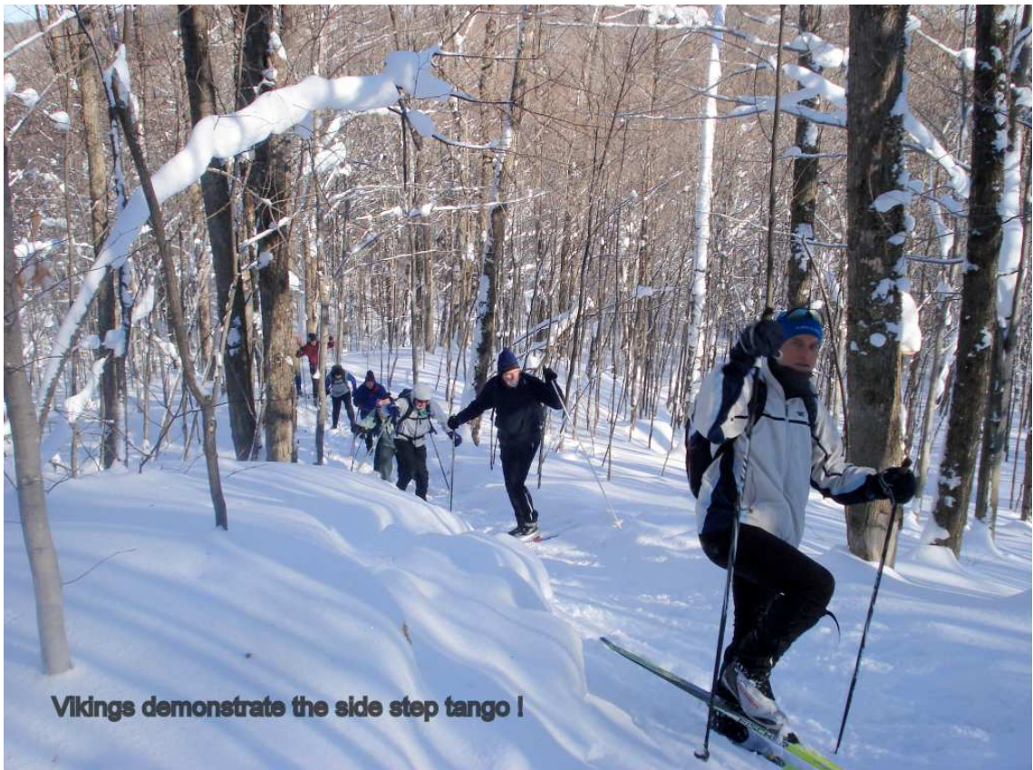
Vikings demonstrate the side step tango !