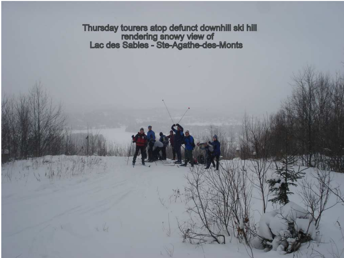
Thursday tourers atop defunct downhill ski hill rendering snowy view of Lac des Sables - Ste-Agathe-des-Monts

After some 5 km into the tour, we veer off for the 1 km climb up to survey a somewhat blurry view of Ste-Agathe. Gordon advises that we are standing on what was, in the “old days”, a down-hill ski centre. Our 1 km return back down to the trail network did indeed give us the down-hill experience!