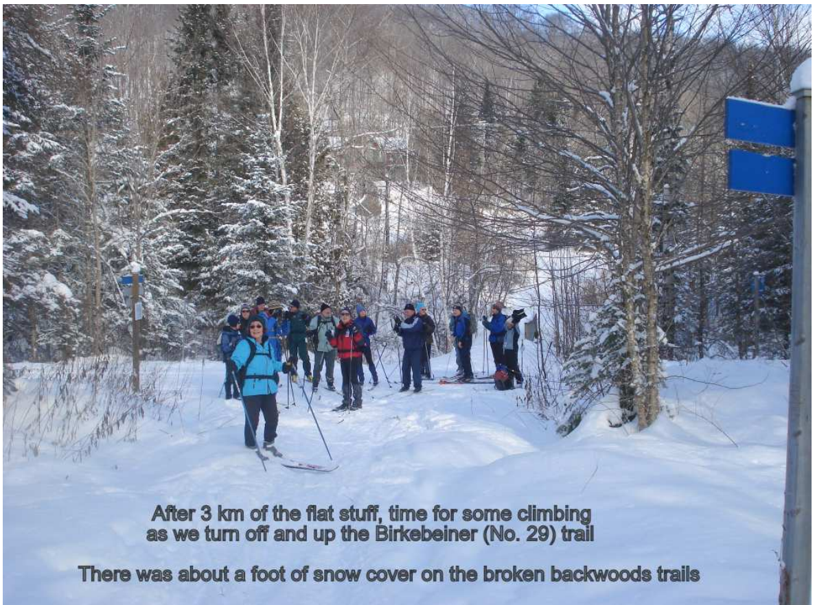
After 3 km of the flat stuff, time for some climbing as we turn off and up the Birkebeiner (No. 29) trail