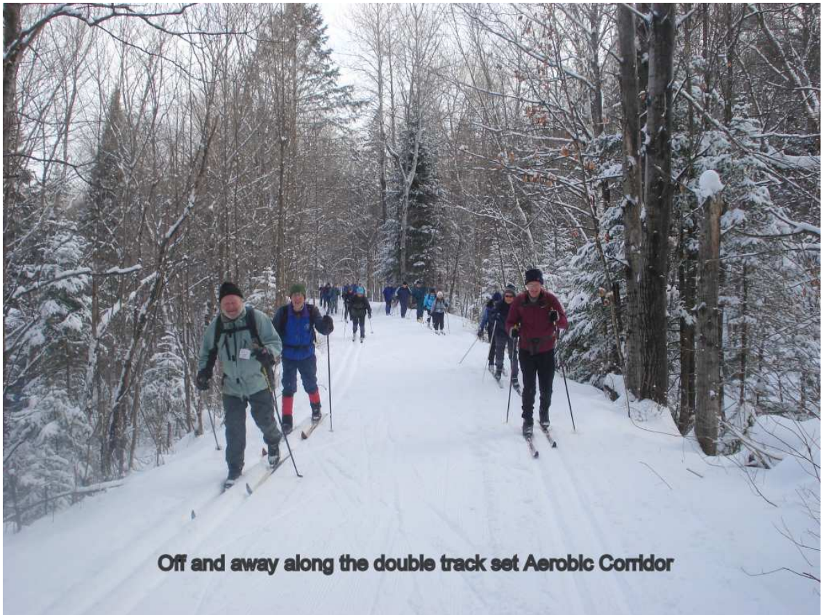
Off and away along the double track set Aerobic Corridor