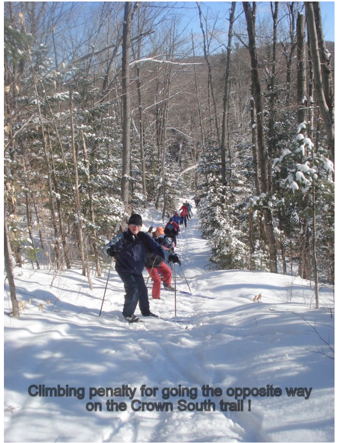
Climbing penalty for going the opposite way on the Crown South trail !