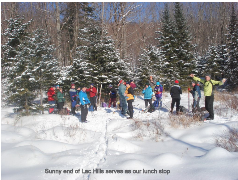
Sunny end of Lac Hills serves as our lunch stop