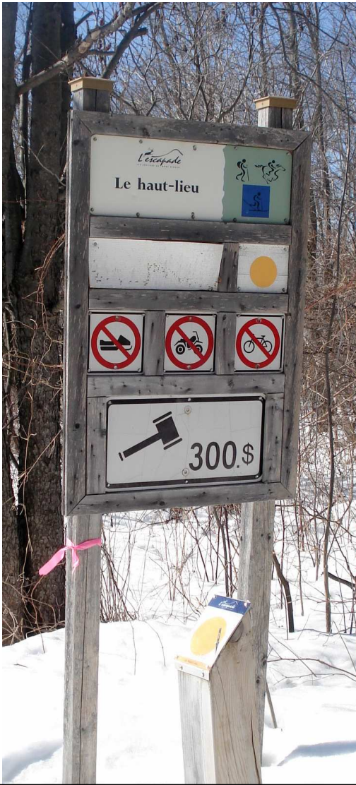
Setting off on the trail, we see that horse riding, hiking and skiing on the trails are free, but this sign would seem to imply that snowmobiling, ATV-ing or cycling could cost you $300 !!!