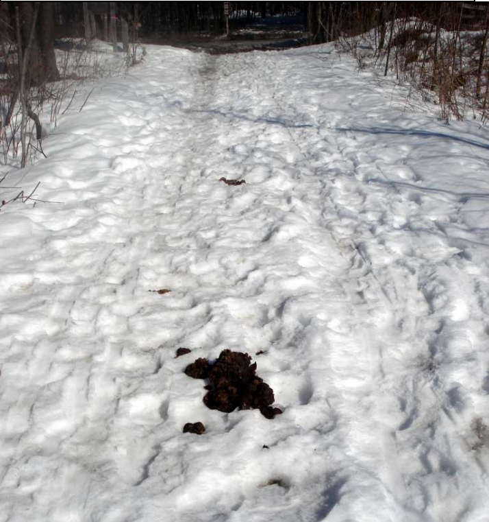
Although we did not encounter any of the equestrian folk on the trails, their "business cards" were in clear evidence!!