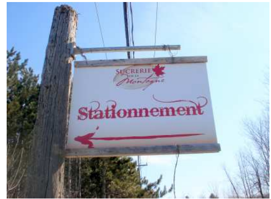
This was our generously appointed rendezvous: the Sucrerie de la Montagne car park, no doubt more crowded when the sugaring-off parties are in full operation.