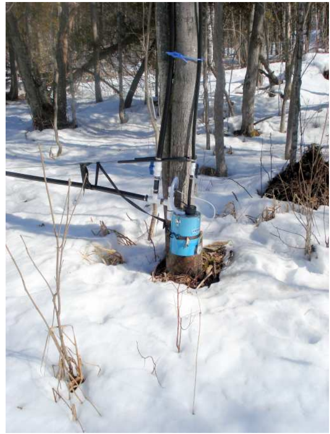
With endless plastic piping, pumps and shacks with purring machines, this was clearly the Trans Canada Pipeline for maple syrup!!