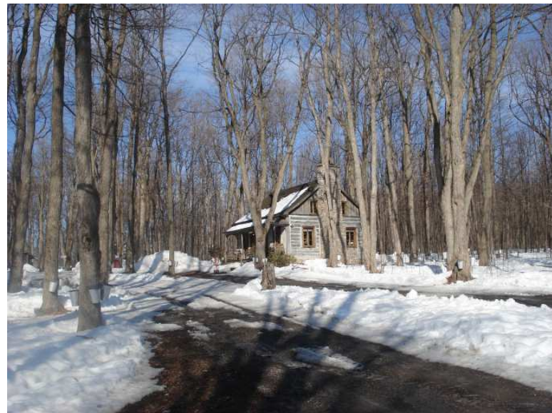
Does not get more bucolic than this with Rigaud icons of work horses, syrup collecting buckets on maple trees and weathered log habitations.