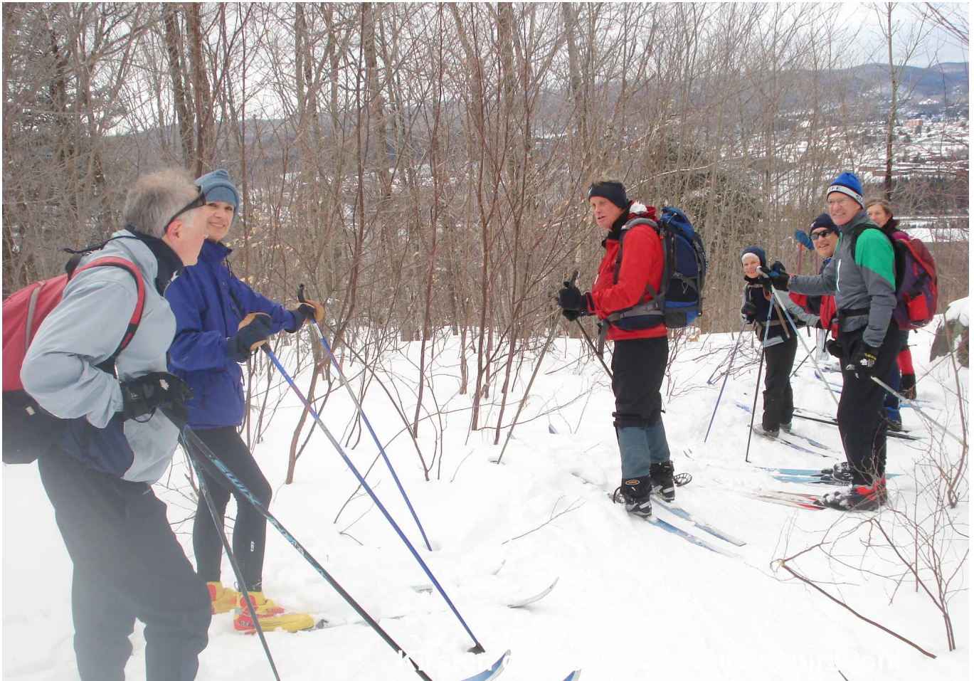
And so after a long climb, we reach the summit of Mt. Catherine (522 m) where saplings are determined to obscure an otherwise panoramic view of Ste-Agathe!