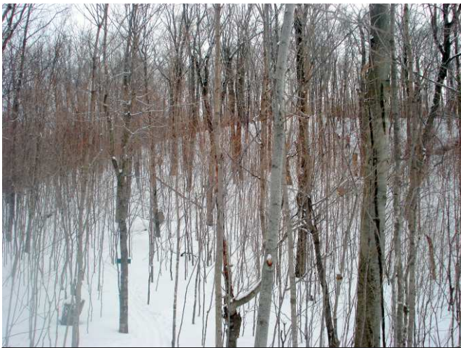
Somewhere in there are skiers, making an “interesting” descent down from the top of Mt. Catherine.