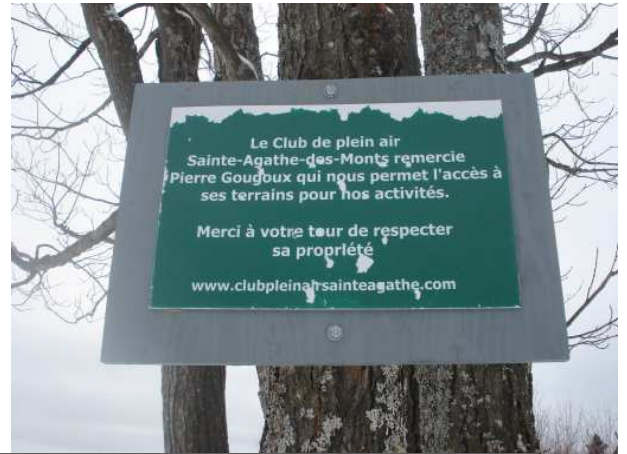
The on site plaque gives thanks to the benefactor of this fairytale log refuge equipped for backwoods sleepovers at elevation 559 m