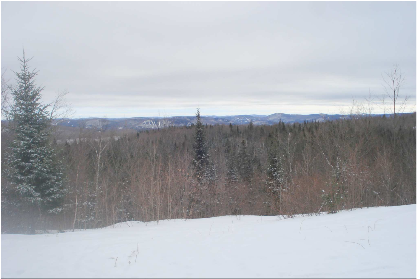
The roughly southerly view from the Refuge de L'Alpage elevation 559 m