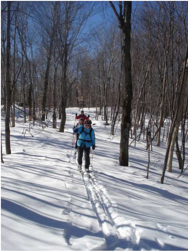
At junction no. 5 on the LND loop, the group splits with one group exploring a new extended and remote southern routing which links back into the Viking Crown South trail.