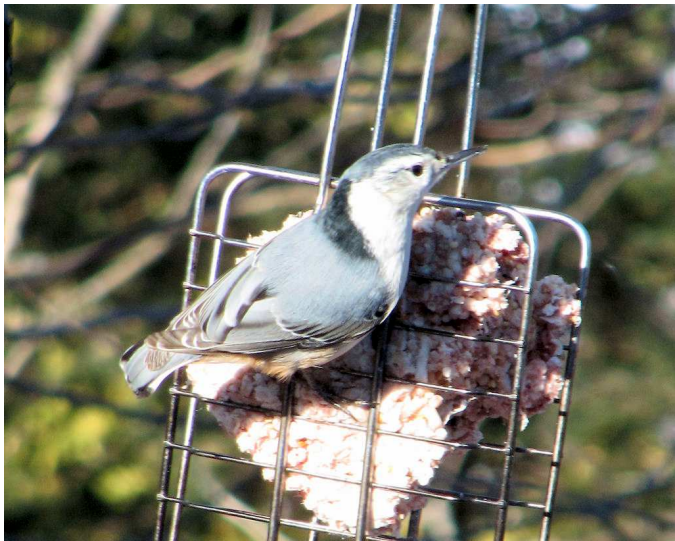
Murray's camera captures these feathered friends enjoying offerings at the porch hanging restaurant!