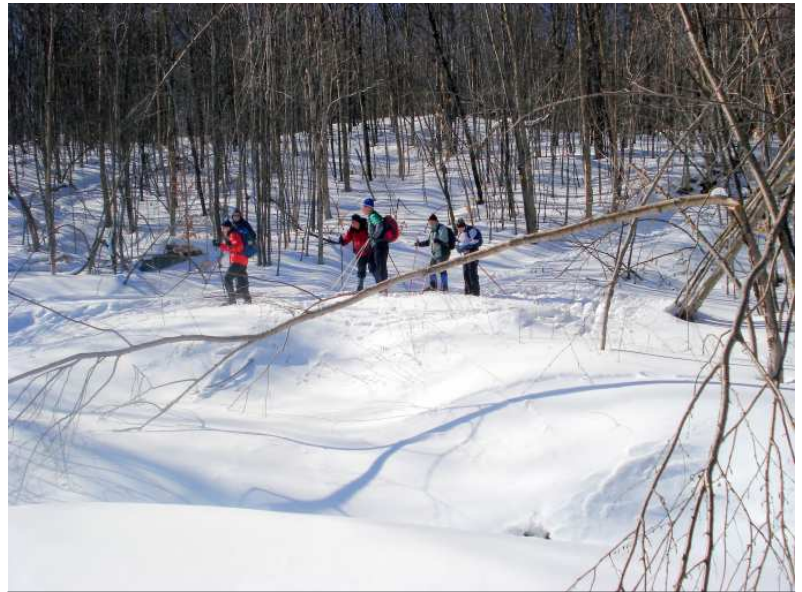
After some doubts, we do finally re-join into the Viking Crown South trail..... and celebrate by having lunch!