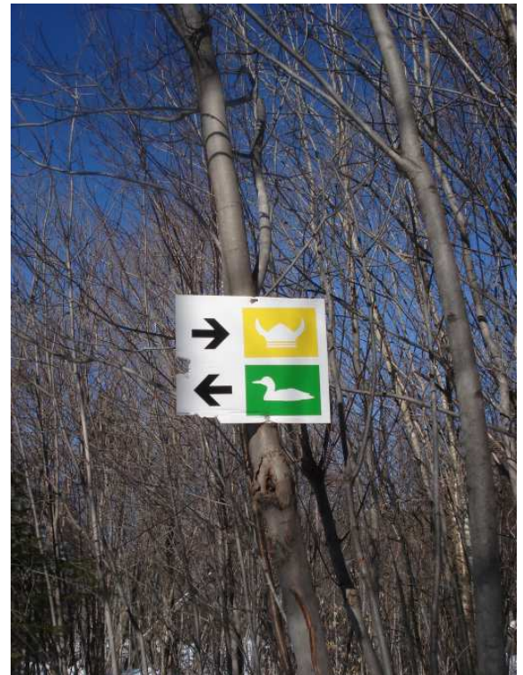
Having shared a common section of trail, the Loon and the Viking must now part ways!