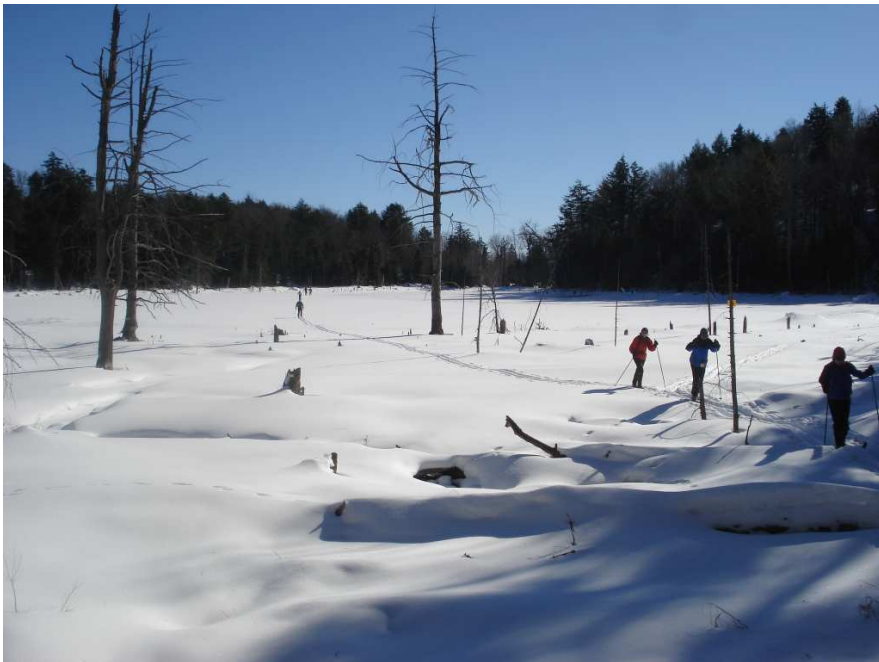
Here we traverse Lac Henri and head north, on the Viking South!