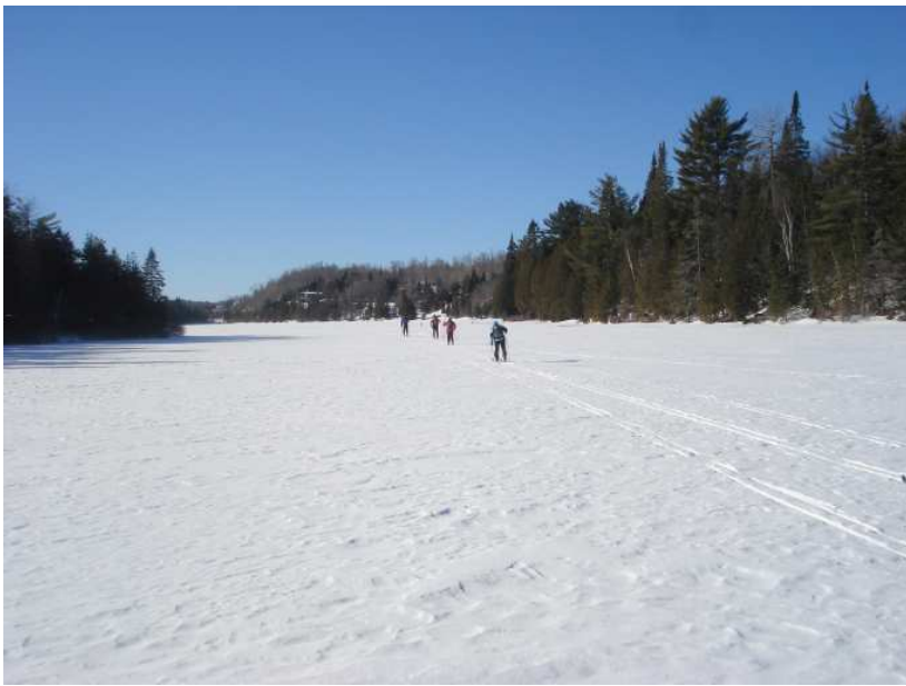
At LND junction no. 1 we head off for a 1.5 km ski across Lac Notre Dame to our start at the Cohen cottage.