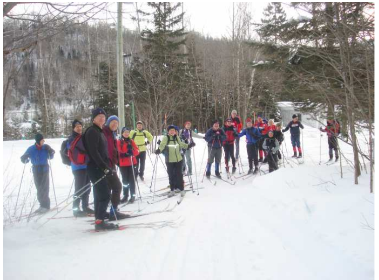
Assembly and first junction body count.....following the first kilometre of skiing through a summer community of camper-trailers, picnic tables and various stored water craft....all entombed in snow and ice..... .....and awaiting the inevitable stir of mosquitoes!!