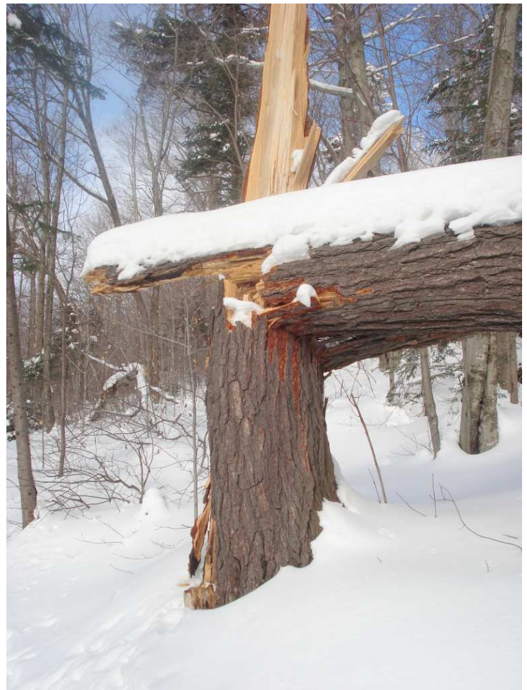
Glad we were not passing by when this one decided to fall trail side!