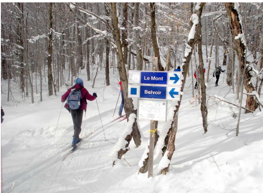
More or less democratic decision made to skip the 2 km side trip to Le Mont which offers a vista of Ste Agathe.