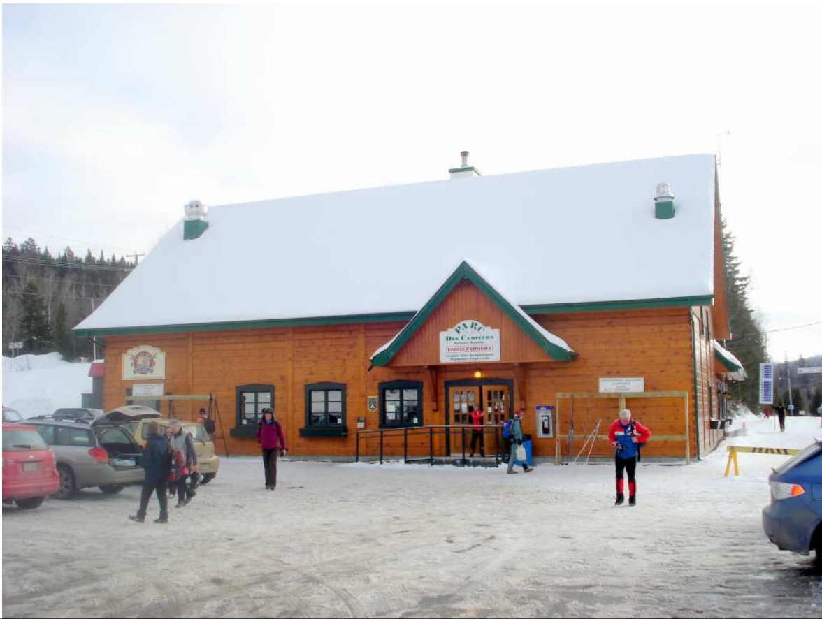
Deservedly award winning - Les Grands Prix du Tourisme Quebecoise 2002 – Le Parc des Campeurs centre offers full facilities, complimented with delightful 47 km network of groomed trails.