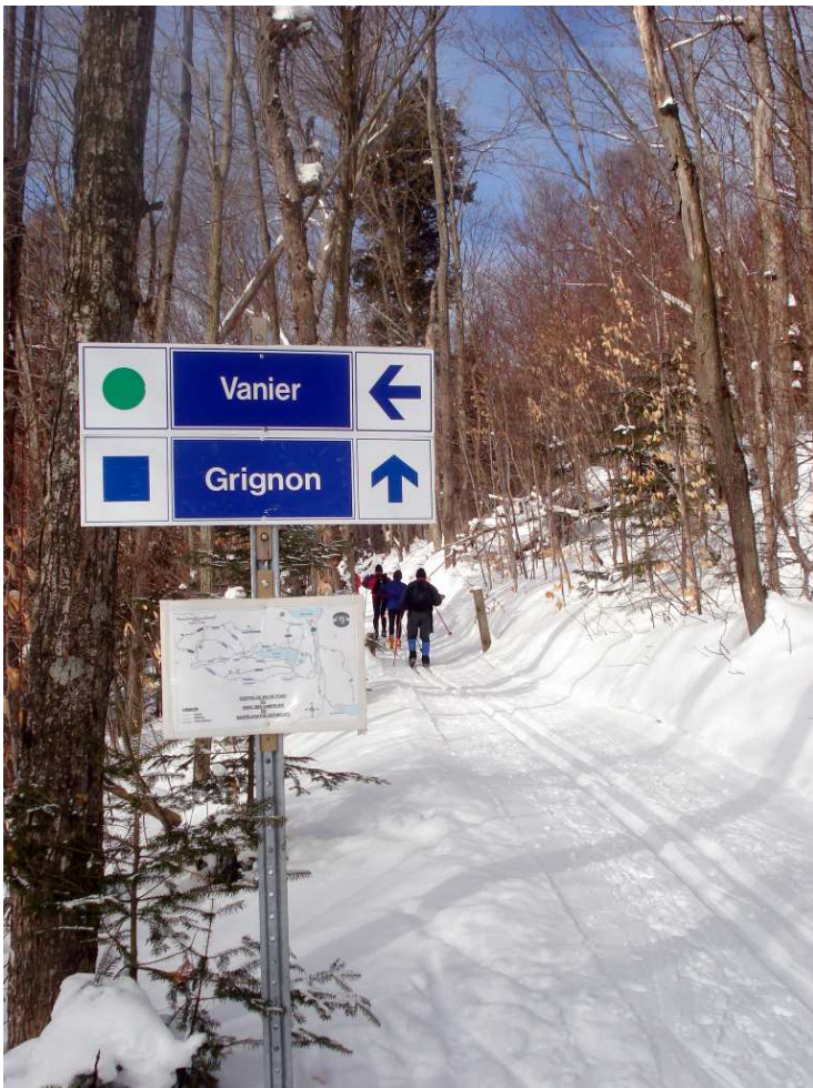
Why take the “facile” trail when you can take the “difficile” one?