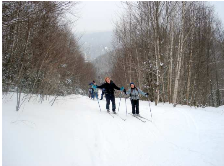
Breathless troops slog up this section of the Mt. Césaire trail, believed sponsored by the Heart and Lung Association! (Césaire -derived from the Latin - seizure (as in heart) !

We rest up after finally reaching the rarefied elevation of 460 m; relaxing long down hills provide well earned gravity payback!