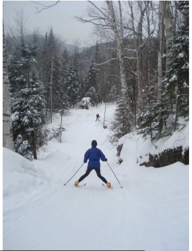
Just one of many great rundowns.....the view from the top...