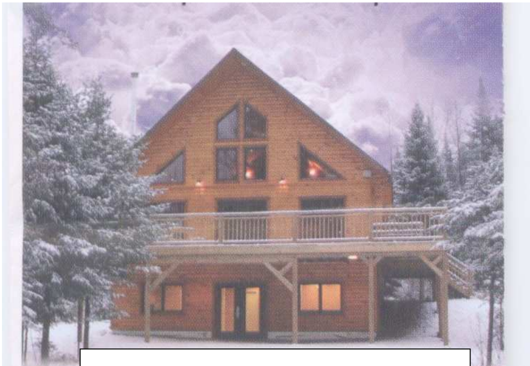
The smaller but cozy Ann Piché Chalet

Despite several trail "errant-navigations" by the leader, we ended up on the P'tit train du Nord and had to seek guidance to the Anne Piché Chalet from a group of young mothers doing outdoor exercises. Here we indulge in an early (11:35 am) indoor lunch, considered a luxury as we usually dine "en piste".