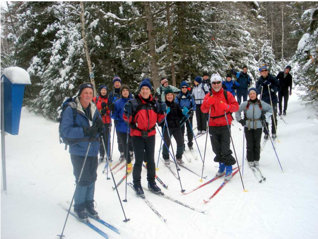
The troops with full gas tanks, ready for the return assault of Mt. Césaire. At this stage, heart rates and blood pressures are normal, but all will change in due course!