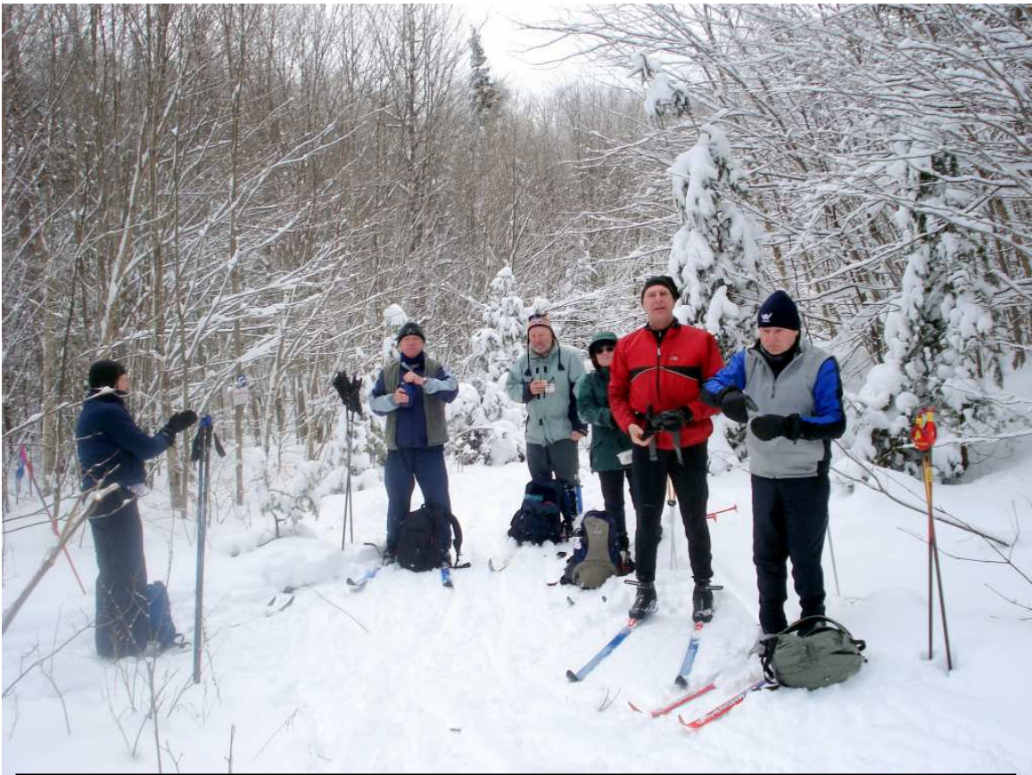
Time out is declared for snacks and drinks at our 6.5 km turn back point.