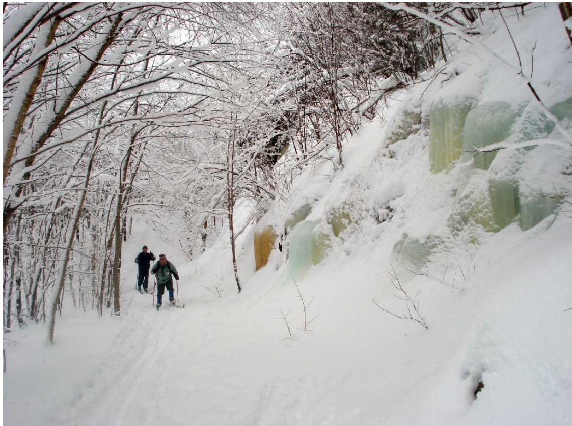
This section of trail takes us past glaciers; not sure if they are retreating... or advancing?