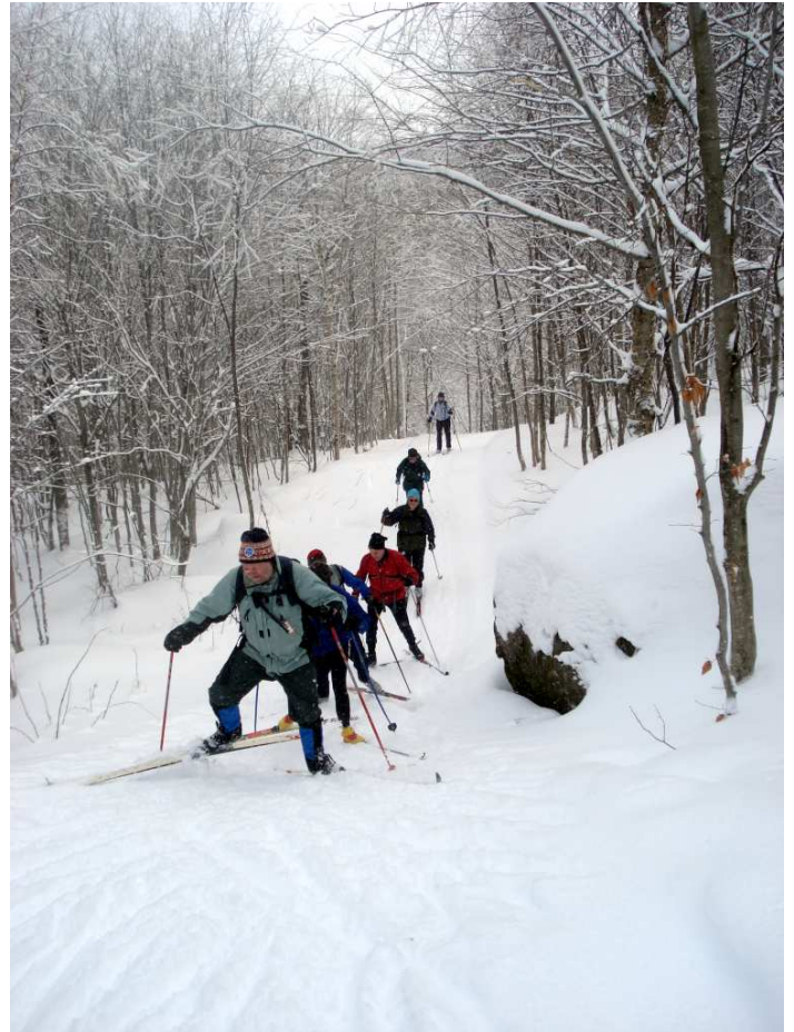
Making progress through a winter wonderland, very similar no doubt to the scene in Britain today!!